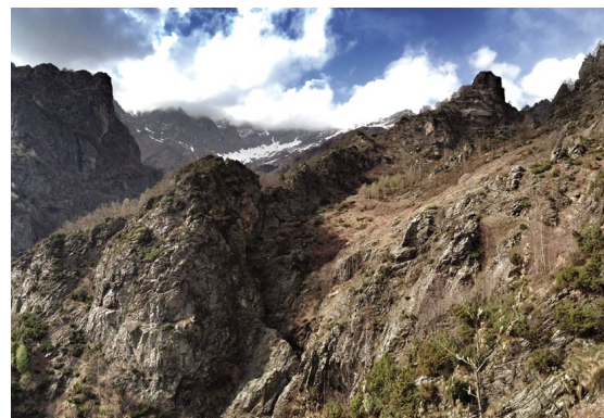
The rugged Alpine mountains, a place of refuge for the Waldenses

One of the most significant primary source evidences for the presence of a substantial group of Waldensian Sabbath keepers during the first half of the thirteenth century was brought