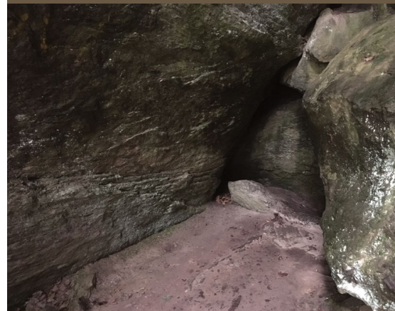
The entrance of a cave in the Valley of Angronia near Torre Pellice, where Waldenses worshiped during times of persecution. It could contain about 200 persons. When discovered they were smoked out and died of suffocation.